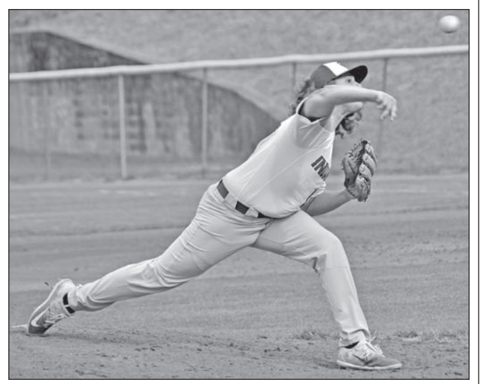
Towns County baseball