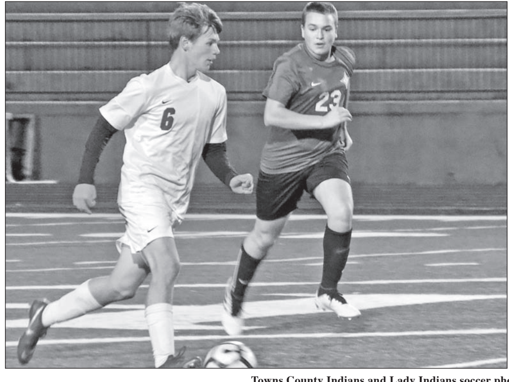
Towns County Indians and Lady Indians soccer

The team had a match record of 10-5. after press time on Tuesday,